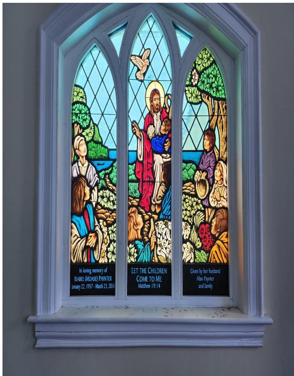
Installed in 2013 at St. Mark's Church